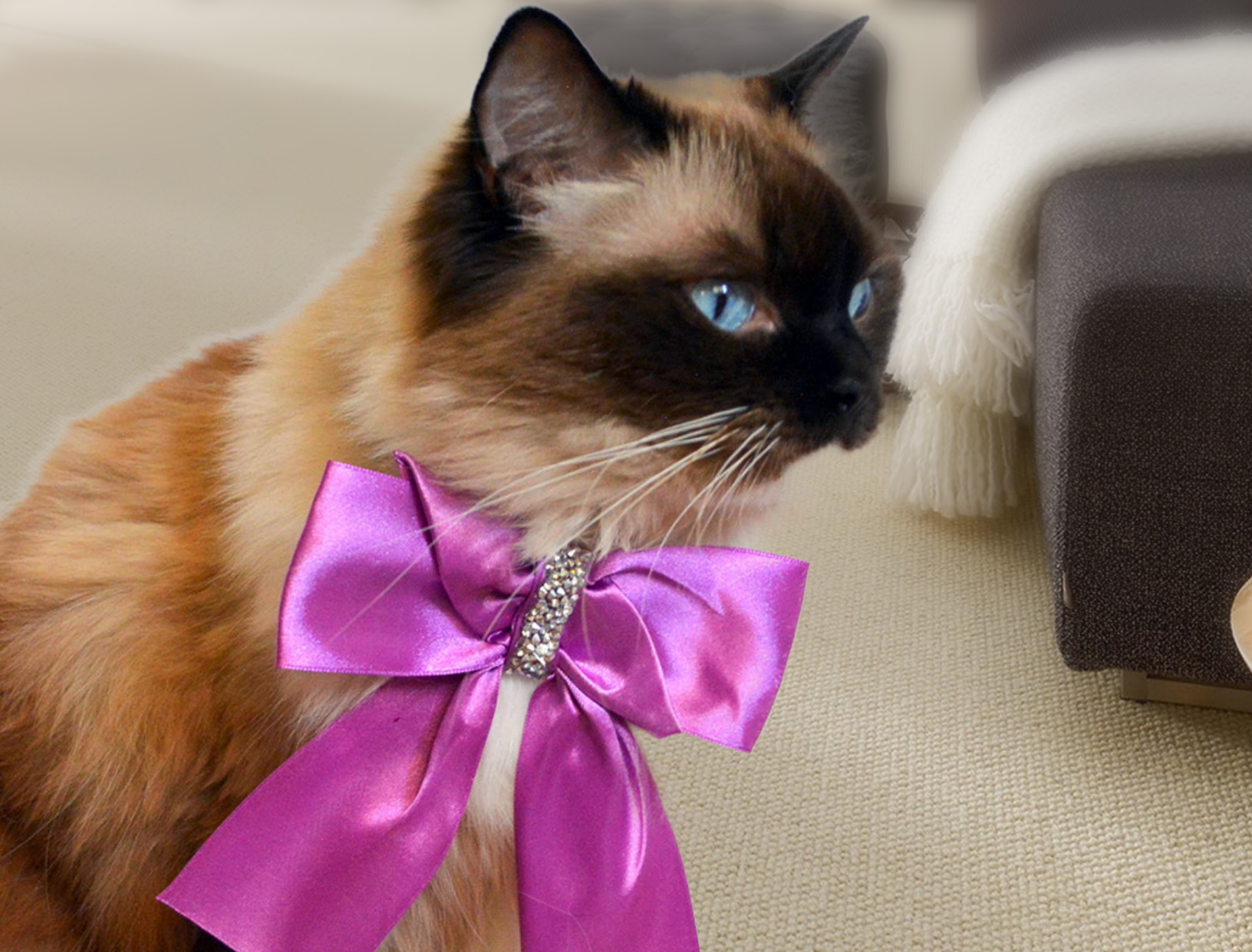
Cat Benatar Cat

“All the other ladies have been jealous and catty since we got our new CoreLogic floor.”